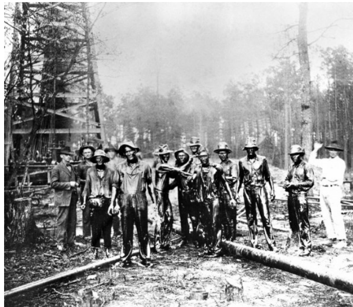
“Workers in the Smackover Oil Fields”