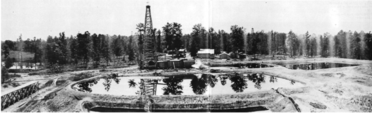
“Wooden Derrick and Oil Storage Pond”

Assignment #6 – Imagine what a typical day was like in early twentieth century Union County, Arkansas. Write a journal entry from the point of view of: